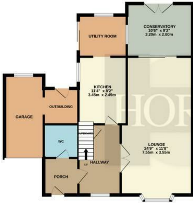
GROUND FLOOR 841 sq.ft. (78.1 sq.m.) approx.